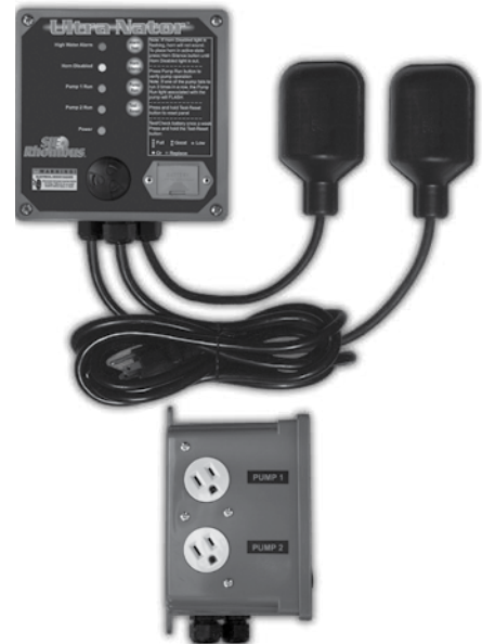
Shown with SJE MicroMaster® pump switches