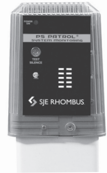
Shown with Mounting Post U.S. Patent Nos. D 780,703 and 9,472,932

The sleek, angled design of the clear enclosure includes a removable cover for easy access for field wiring. All internal components are sealed within the cover for protection from the elements. The red LED illuminates the cover in an alarm condition for easy 360° visual identification. Available with or without 32" mounting post.