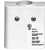
Home Temperature Monitor