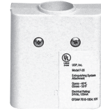
Home Temperature Monitor