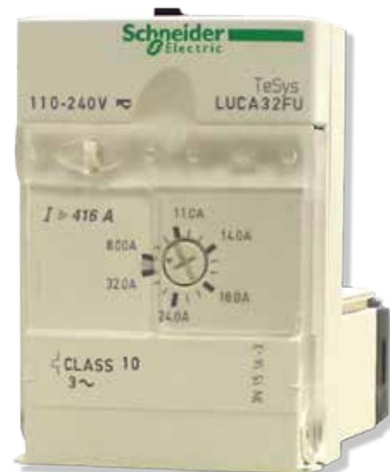
Interchangeable Overload Module