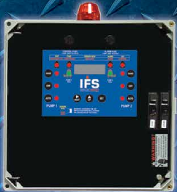
Installer Friendly Series® Duplex model shown