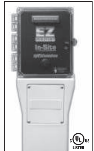
EZ Series® In-Site® CL Control Panel for data logging

* Data connection cable required for installation and downloading data sold separately.