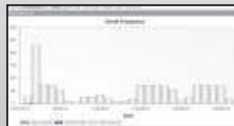
Daily Events Screen