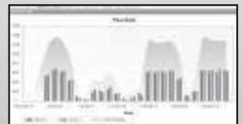
Daily Flow Screen